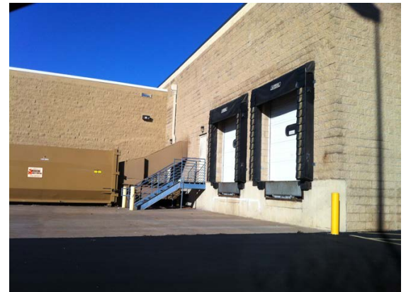
2 Bay Rear Loading Dock