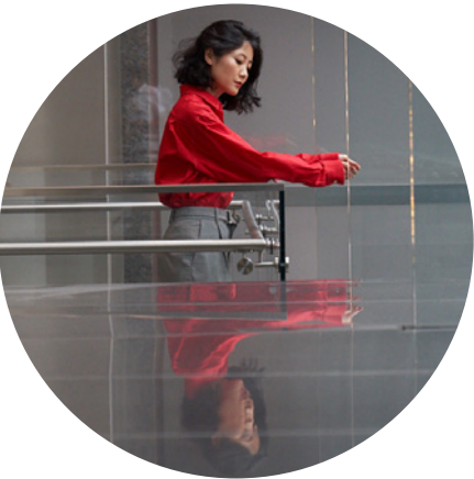
@ALICE_GAO 950K FOLLOWERS FASHION & LIFESTYLE