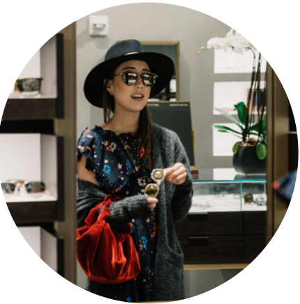
@EGGCANVAS 383K FOLLOWERS FASHION & LIFESTYLE