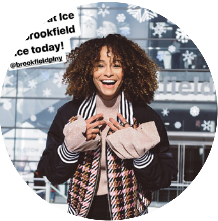
@SCOUTTHECITY 392K FOLLOWERS FASHION & TRAVEL