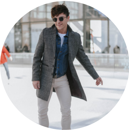
@JUSTINLIV 306K FOLLOWERS MEN'S FASHION & LIFESTYLE