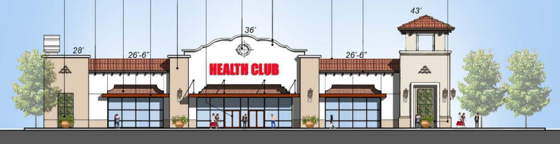
WEST ELEVATION SCALE: 1/16"=1'-0"

11 GS 12 P4 8 TP1 6 M1 1 P3 5 10 P1 1 P1 2 R1 4 WS 1 P3