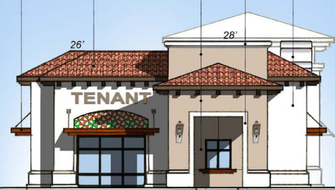
SOUTH ELEVATION SCALE: 1/8"=1'-0"