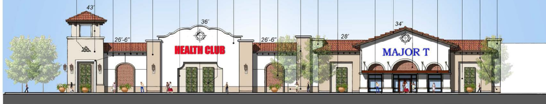
SOUTH ELEVATION SCALE: 1/16"=1'-0"

9 1 P2 1 P1 12 P4 1 P3 1 P2 10 P1 11 GS 1 P1 2 R1 8 TP1 1 P3 1 P1 11 GS 7 ST 4 WS 8 TP1 6 M1 1 P2 1 P3 1 P1