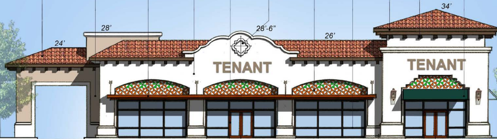
EAST ELEVATION SCALE: 1/8"=1'-0"

2 R1 1 P3 6 M1 1 P1 5 10 8 TP2 7 ST 4 WS 12 WS 3 F3