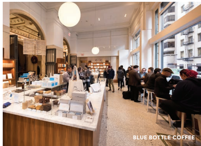
BLUE BOTTLE COFFEE