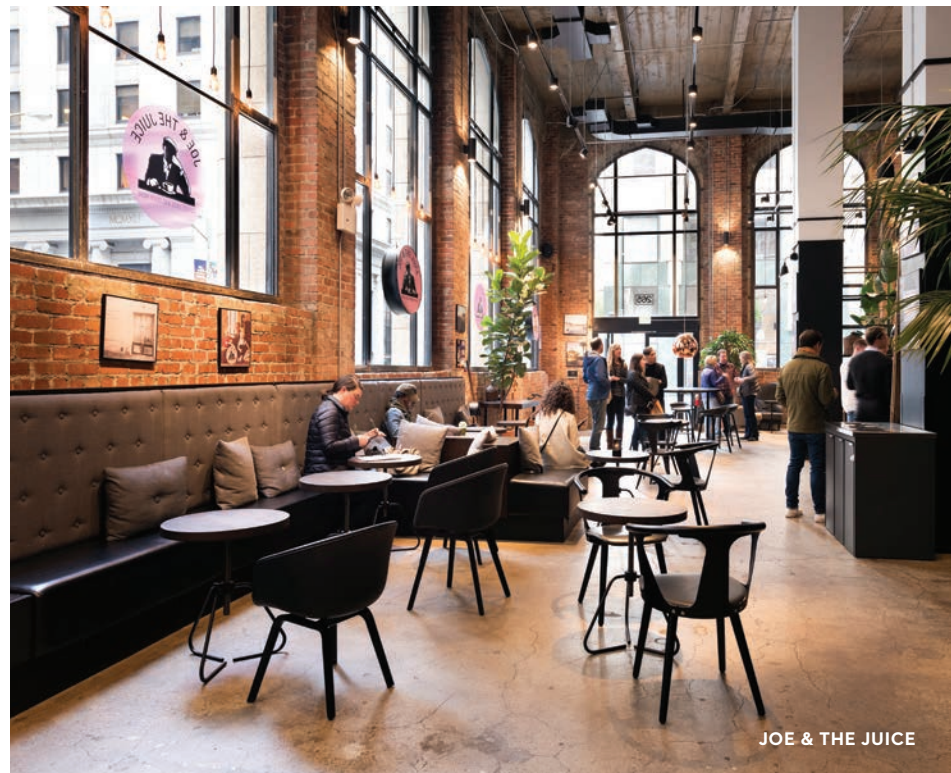
JOE & THE JUICE