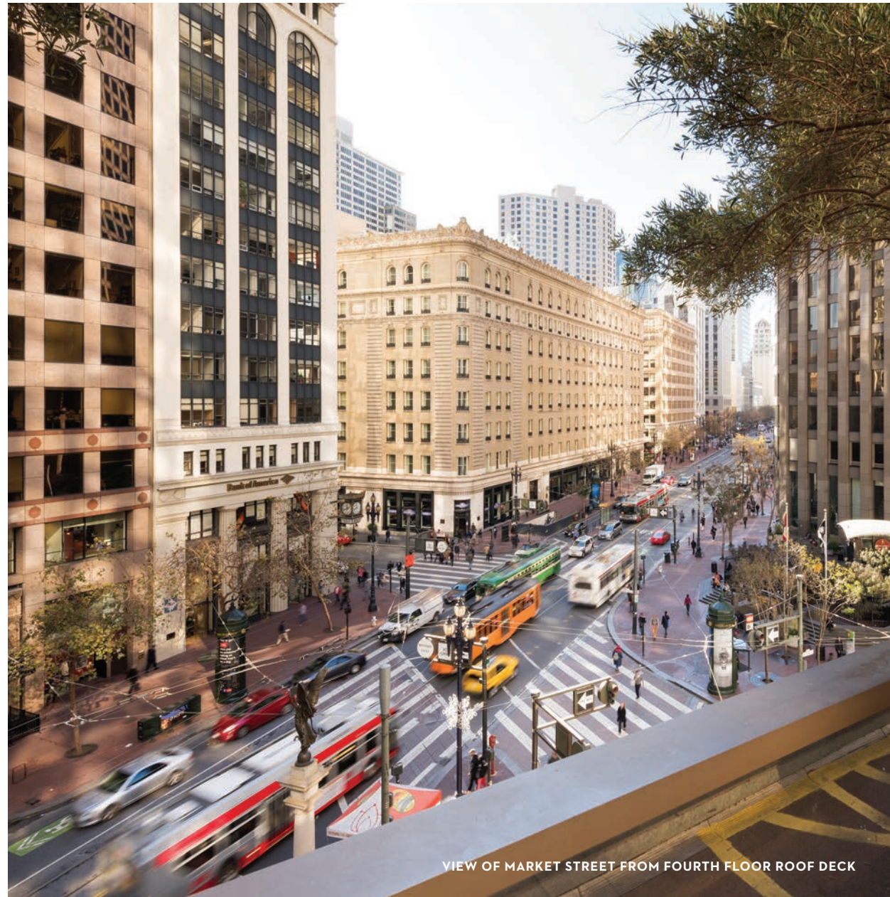
VIEW OF MARKET STREET FROM FOURTH FLOOR ROOF DECK