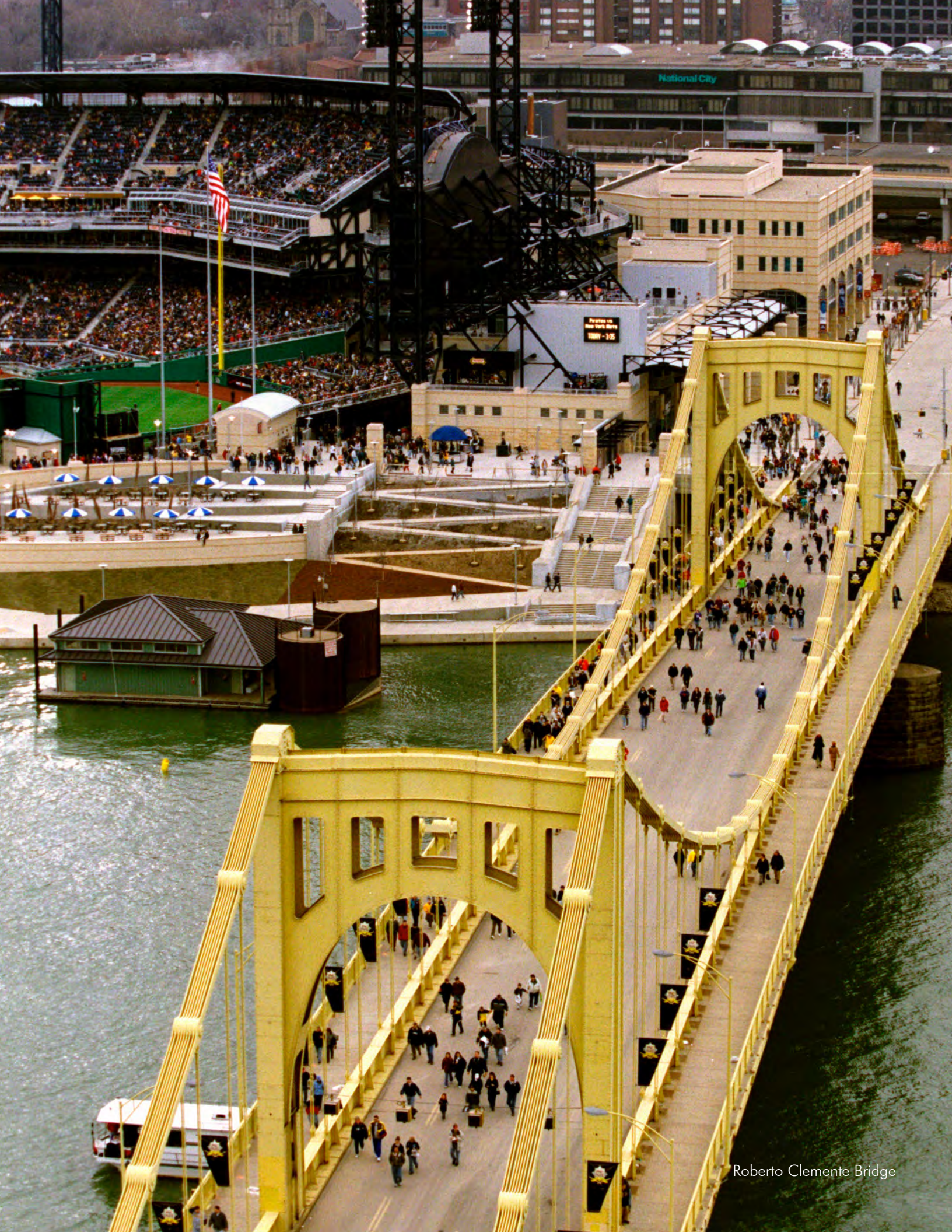
Roberto Clemente Bridge