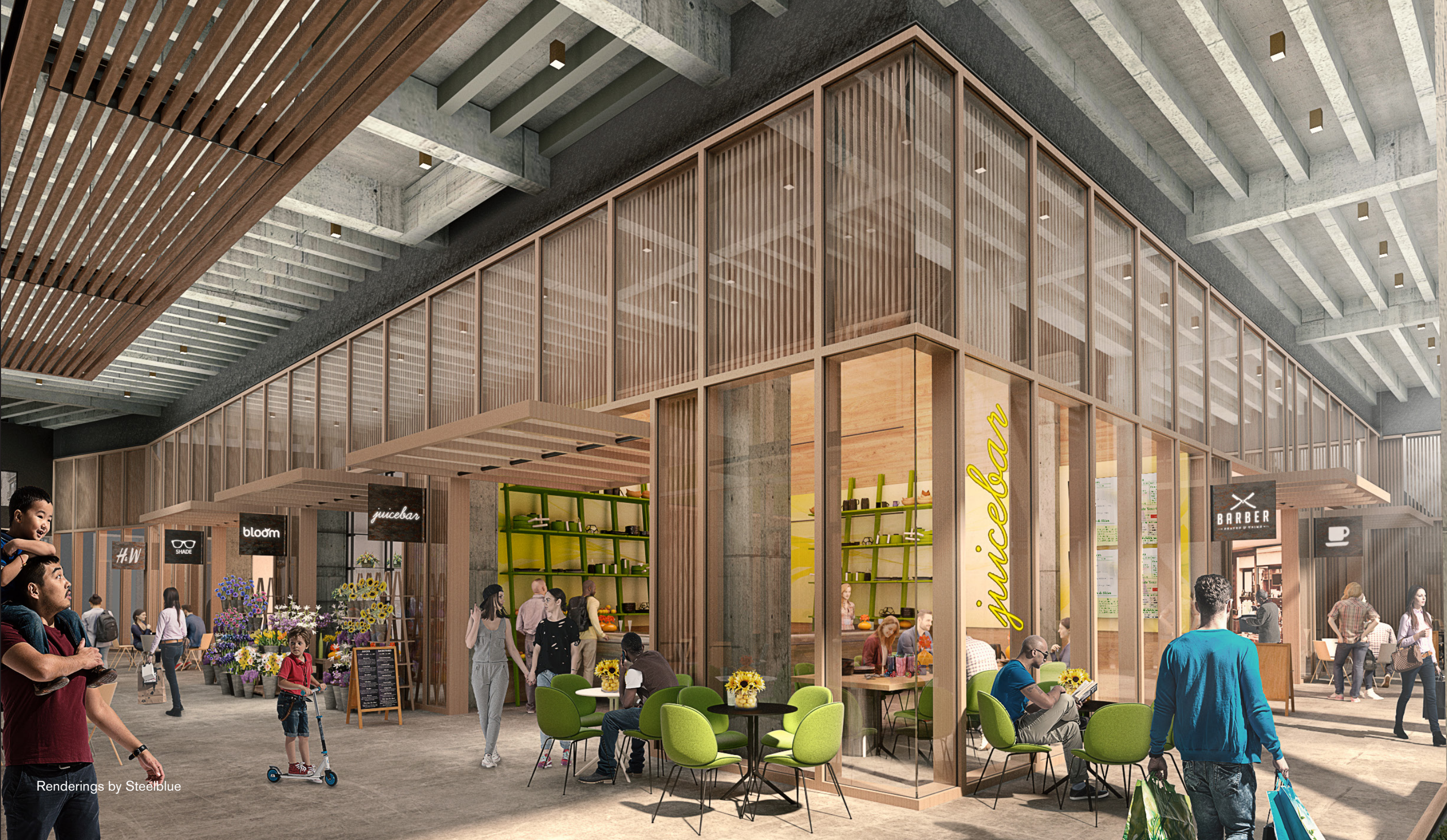
Renderings by Steelblue

Oakland First Friday draws over 10,000 - 15,000 visitors nightly and business increases in revenue 100% to 250%